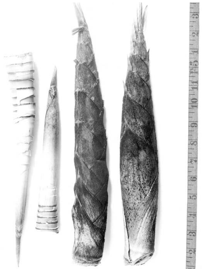
First fruits: four Moso shoots (two peeled, two unpeeled) from E.A. McIlhenny’s initial shipment to David Fairchild, April 1915. (EAMC)

I have had a photograph taken of these shoots and will send you a copy of it for your own use. [See below.]